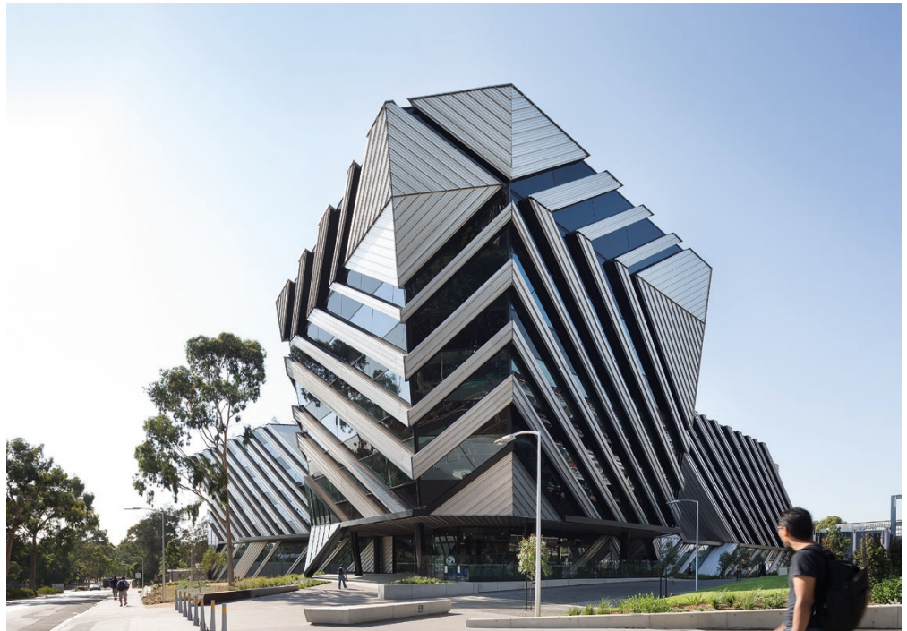
Monash University, Melbourne, Australia

At Monash University in Melbourne, X-ray scientists are at the forefront of new techniques in phase-contrast imaging. In recent years, an in-house instrument based on the Excillum MetalJet has enabled a compact, simple to operate imaging set-up in comparison to synchrotron and compact light source methods.