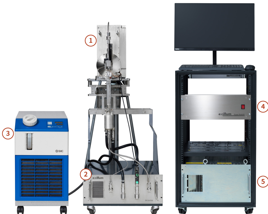
1) Source head 2) Jet pump module 3) Chiller 4) Power module 5) High voltage generator. The picture shows an installation example including racks and monitor (not included in delivery).

Ambient: 20-30 °C (stable within \pm 0.5 °C for optimal source stability), max 85 % relative humidity.